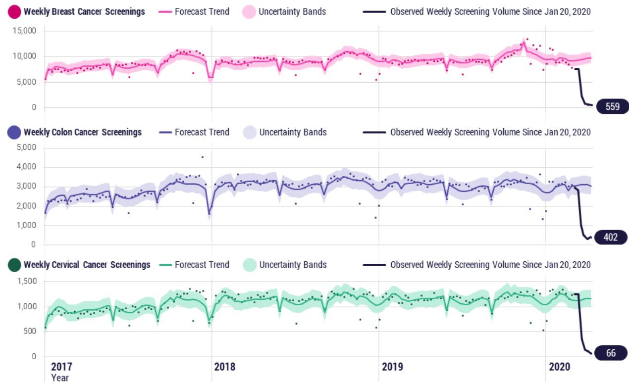
Figure 3. Weekly cancer screening volumes (colored dots) vs. time. Colored line segments indicate fitted estimates from GAM model, combining long term trend, yearly seasonal, and holiday effects; beyond January 19, 2020, they represent forecasts. Lighter colored areas show the uncertainty intervals. Black segments show observed volumes after January 20, 2020.